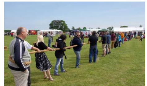
Langham Fete: Tug o' War