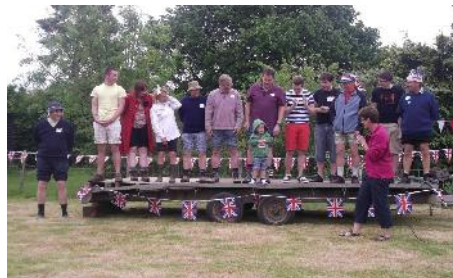
Boxted Green Lane: Knobbly Knees competition